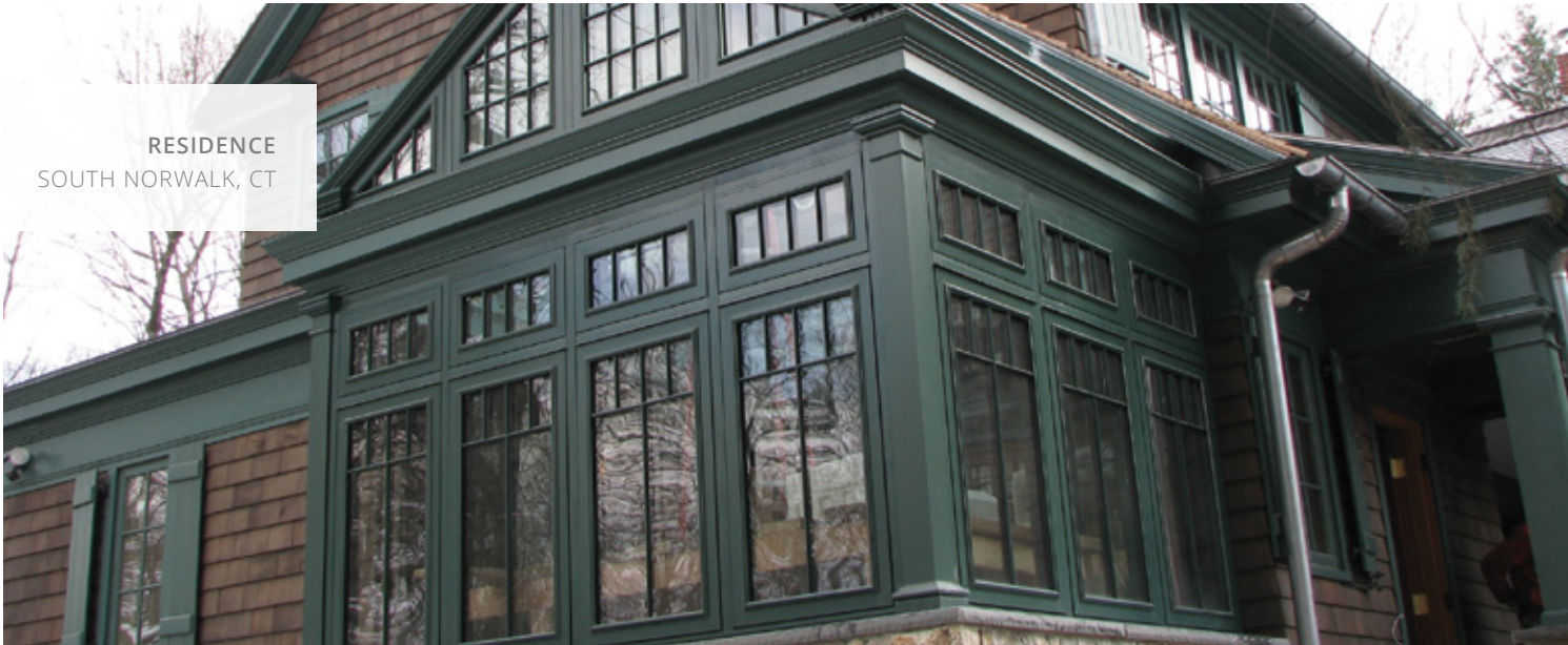
RESIDENCE SOUTH NORWALK, CT