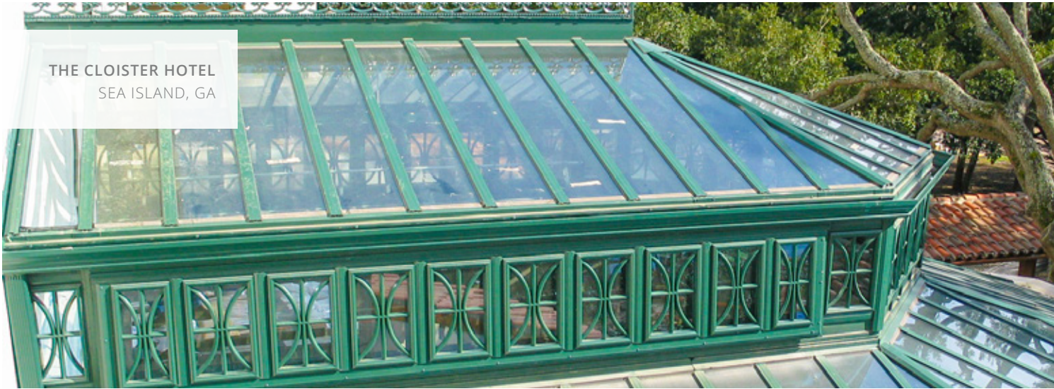
THE CLOISTER HOTEL SEA ISLAND, GA