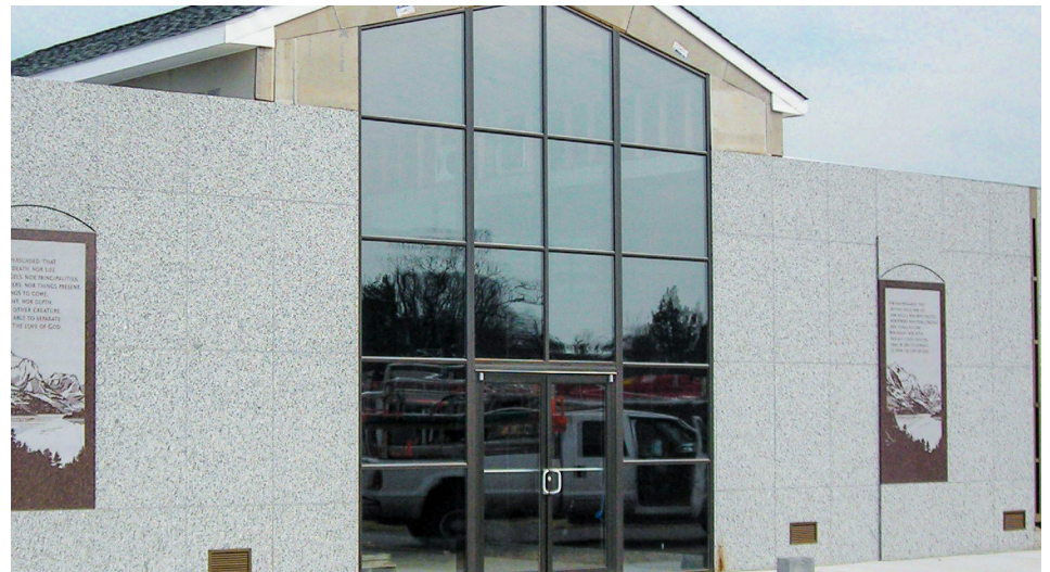
CHAPEL MAUSOLEUM PROJECT ID 06-09-052