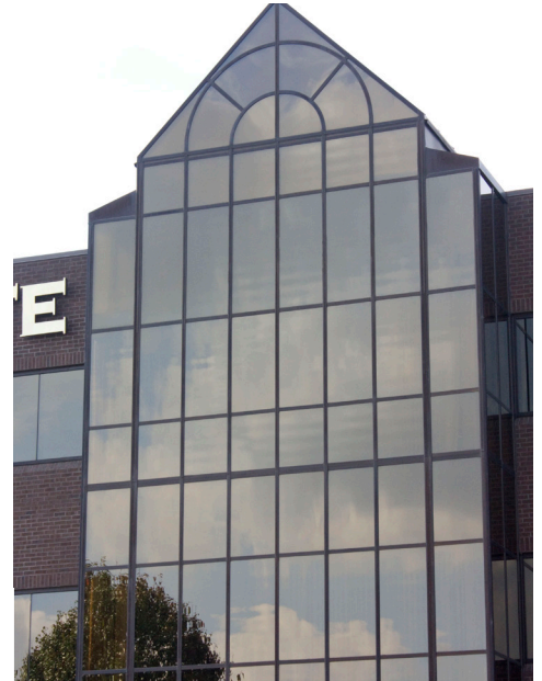
NORTH POINTE BUSINESS FACILITY PROJECT ID 2165